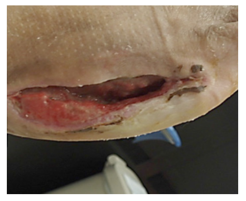
Day 7: 30% reduction in wound volume and reduction in drainage