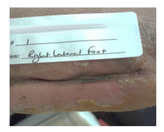
Closure achieved in part due to approximately 30 days of PICO sNPWT use (Individual results will vary)