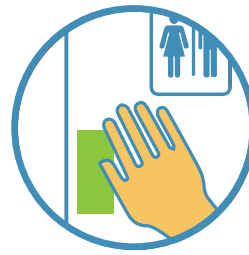
TOUCHING Contaminated Surfaces

The COVID-19 pandemic has made reducing the spread of the flu during the 2020-21 season more important than ever. Decrease the burden on healthcare systems by taking steps to stop the spread of germs in your facility.