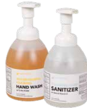
550 mL Pump Bottles

Symmetry hand hygiene products, mounted dispensers, and customizable tools that cater to your school's needs.